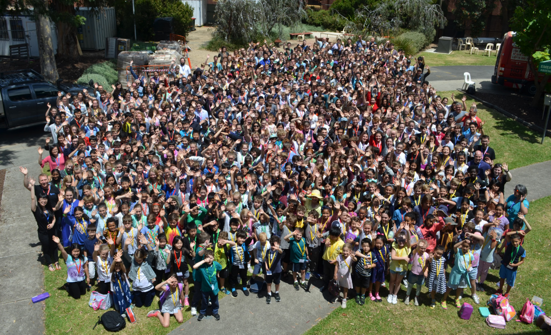
MYO 2018 Summer School participants.