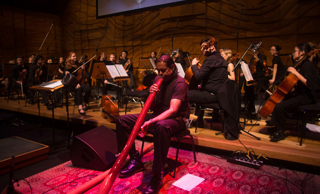
MYO and Outer Urban Projects at the Melbourne Recital Centre.

Since 1893, the Newsboys Foundation has been supporting disadvantaged young Victorians, enabling them to participate in academic pursuits, arts and culture, sport and outdoor education and develop lifestyle skills.