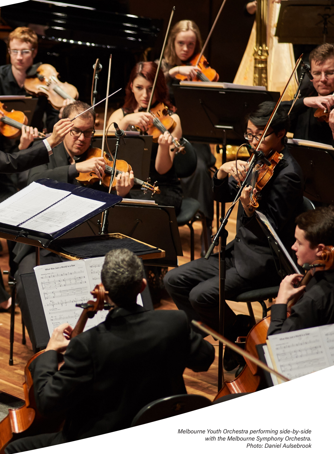
Melbourne Youth Orchestra performing side-by-side with the Melbourne Symphony Orchestra.